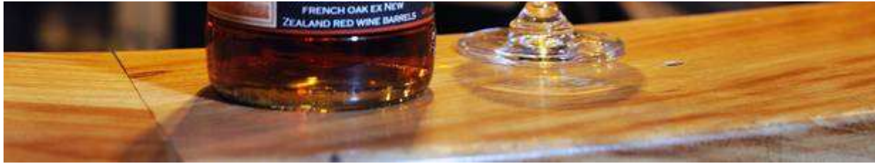
The award-winning Dunedin Distillery Double Wood Whiskey.

The Global Distillery Tour will be published this month with a range of itineraries around local spirits and regional cocktails.