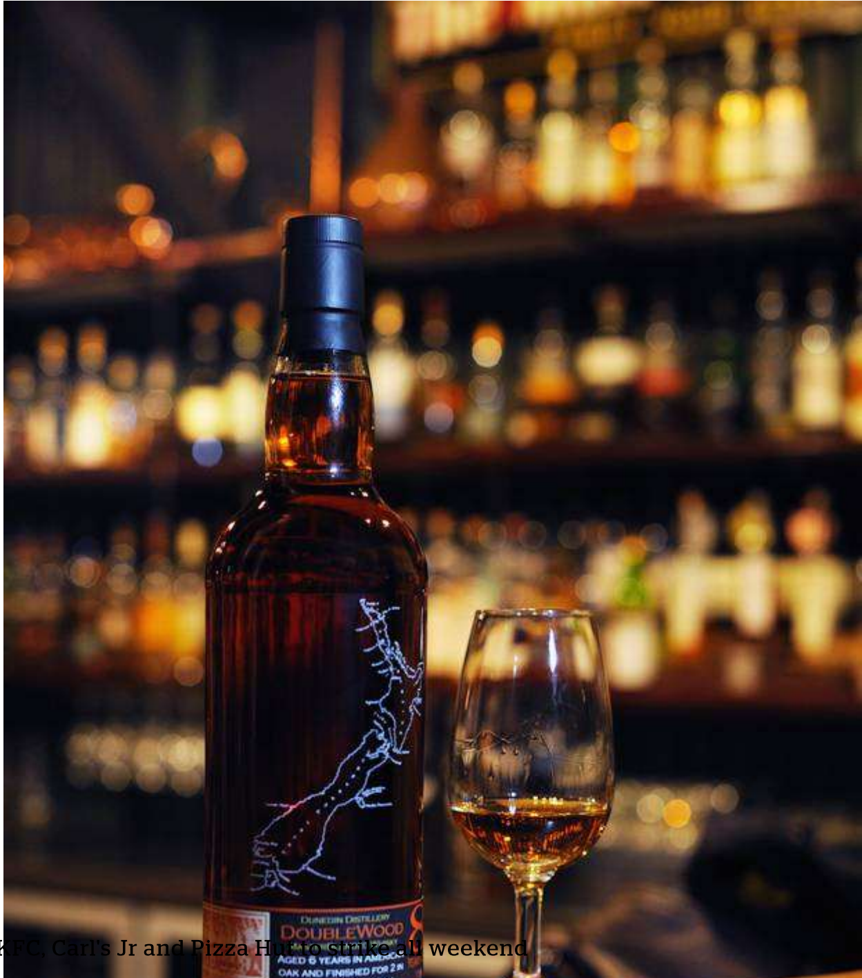
u: Hundreds of workers at KFC, Carl's Jr and Pizza Hut to strike all weekend